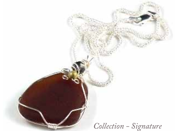
Collection - Signature

We are proud to use 100% original, unmodified sea glass, combined with top quality metals and materials.