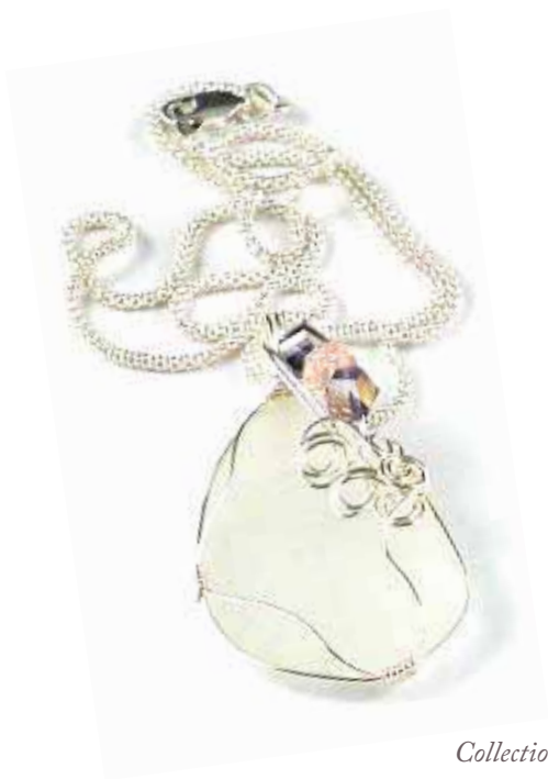
Collection - Signature

At the age of 15 I moved to Inverness, N.S. I was enamored with sea glass and was always collecting it. It was everywhere in my house, spilling over glass bowls and filling jars, but I never made anything with them.